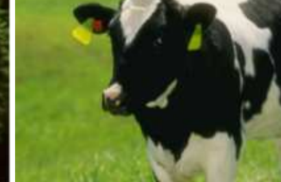
Int. Statistical Inst.: Proc. 58th World Statistical Congress, 2011, Dublin (Session STS042)